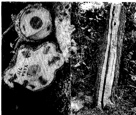
Fig. 3. Sections from a tree badly damaged by Phyton (HD). Left, cross sections at the root collar and 1 m above; right, sapwood discoloration extending from injection point (arrow) through the first 1 m section of the tree.